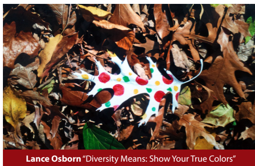
Lance Osborn "Diversity Means: Show Your True Colors"