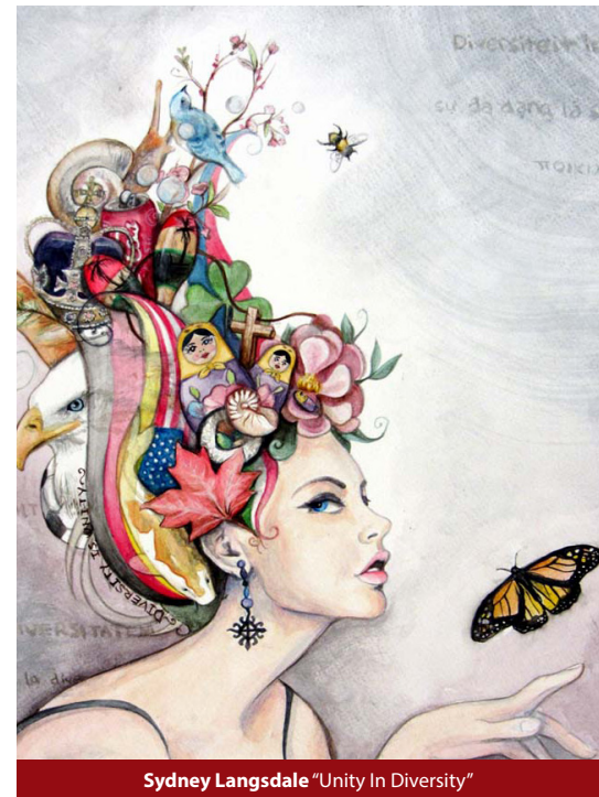
Sydney Langsdale "Unity In Diversity"